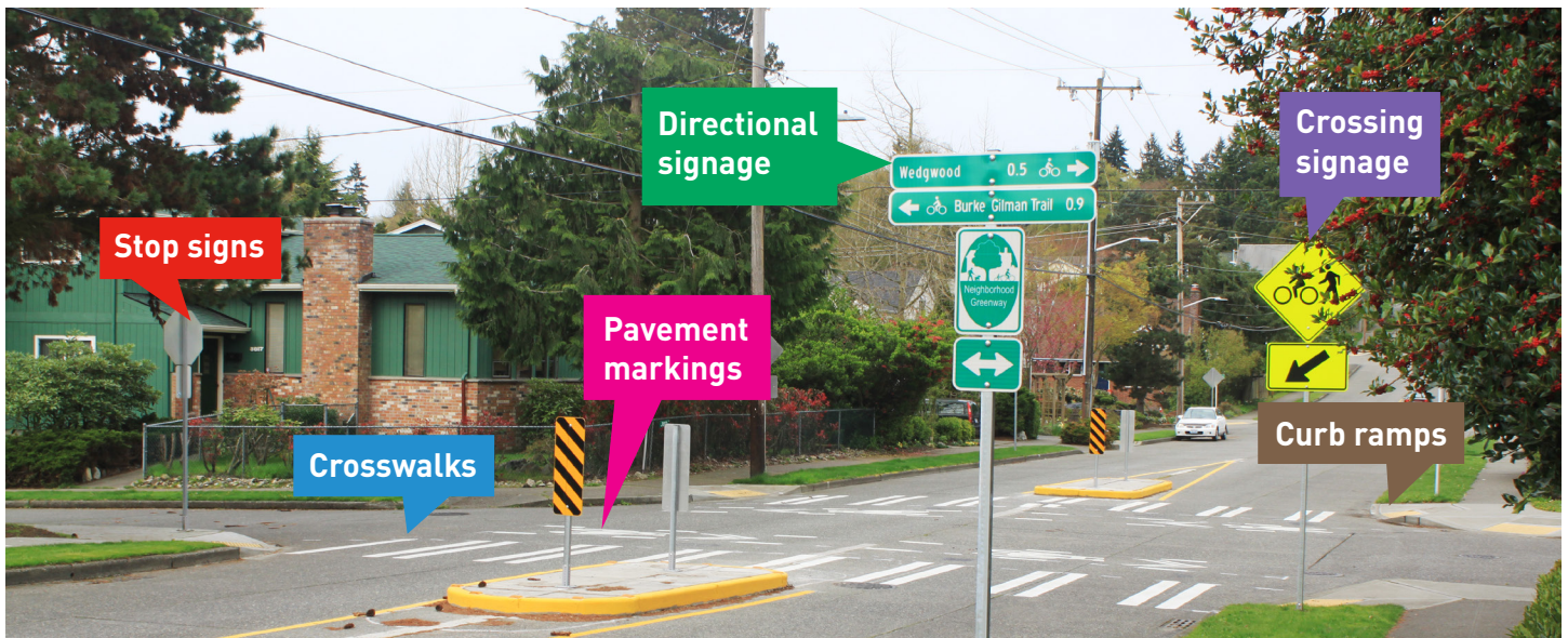
Example: neighborhood greenway improvements help people cross busy streets

Curb ramps installed along microsurfacing streets North end connection to Mountains to Sound Trail